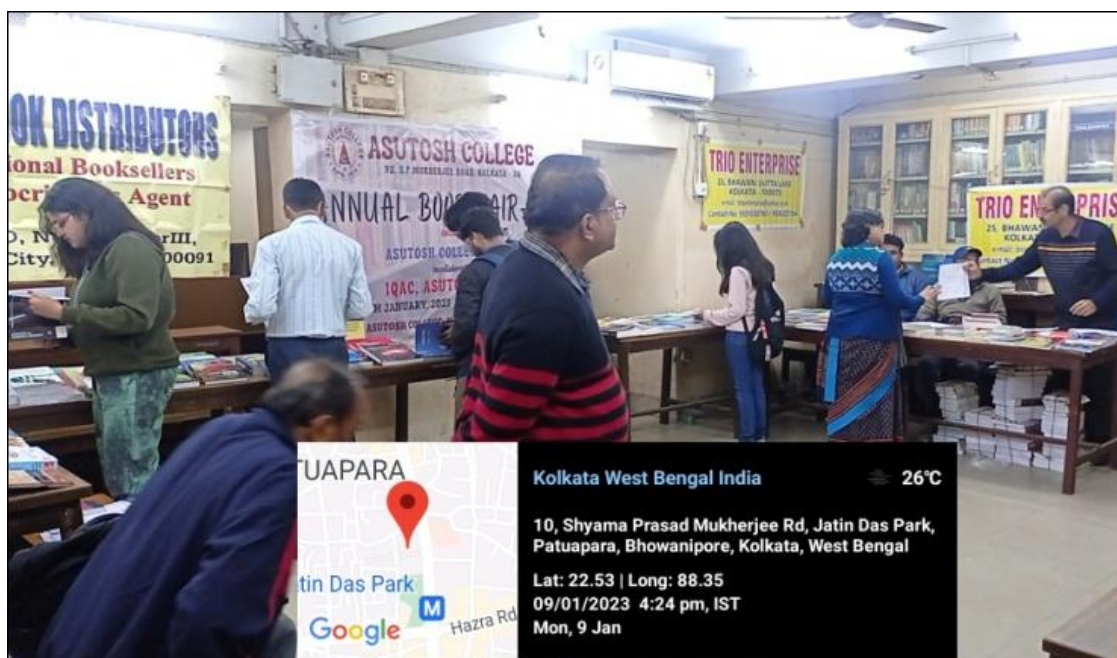
Reading Library, ACTC Building

On 9 th January ,2023, Monday hundreds of our academic community members visit enthusiastically the Annual Book Fair cum Book Exhibition 2023 at the Reading library of ACTC Building along with the Central Library, Main building . The renowned book distributors like Trio Enterprise, Bharat Books, S. B. Enterprise, B. Bros. & Co., K. M. Enterprise, Unique Books , Platform Book Centre etc. brought books from publishers of international, national and locally reputed publishers to meet the academic thirst of our students, faculty members and others. The event offered a unique approach before the academic community to interact among the stake holders like publishers, vendors, writers and readers. From the book fair books for all departments have been selected and purchased to cater the current demand and cope up with the future requirements.